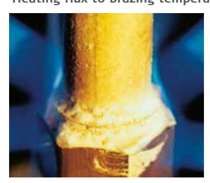
The flux becomes white and solidifies as water is driven off